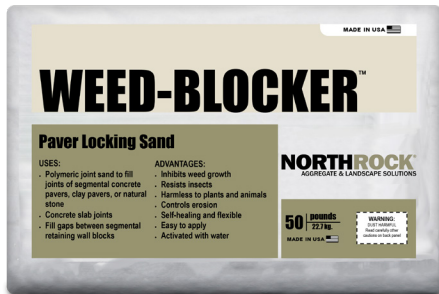
Weed-Blocker™ Paver Locking Sand BOM #109551

NorthRock Weed-Blocker Paver Locking Sand is a specially formulated polymer-modified joint sand for use with pavement systems utilizing interlocking concrete, clay, or natural stone pavers; concrete slab joint applications; or filling gaps between segmental retaining wall blocks. The polymer in Paver Locking Sand becomes activated when combined with water to hold the sand in place by binding together the individual sand particles to set firm while remaining flexible and allowing for movement in the pavement system.