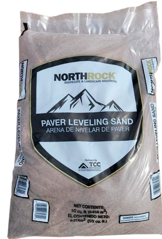
Paver Leveling Sand BOM #103130