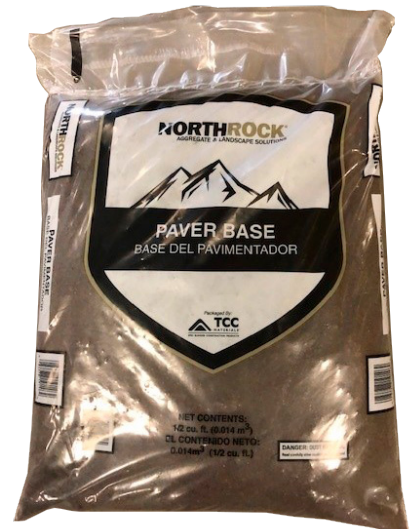
Paver Base BOM #106100